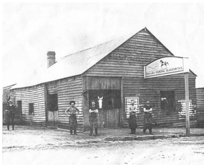
Brown Brothers Blacksmiths.