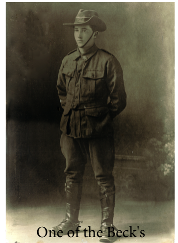
One of the Beck's