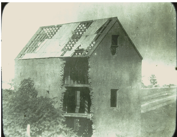
Bega Flour Mill