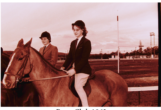
Pony Club 1962