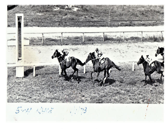
Bega 5th Race