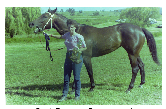
Bush Races at Ravenswood