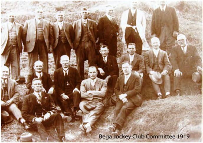
Bega Jockey Club Committee 1919