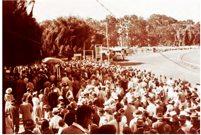
Bega Racecourse 1957